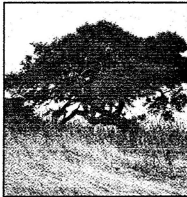
A Coast Live Oak

Saturday and Sunday, October 14-15, 2000, from 10:00 a.m. - 4:00 p.m. at Sepulveda Garden Center, 16633 Magnolia, Encino.