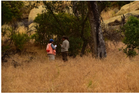
Oak Woodlands – Southern Buffer Zone