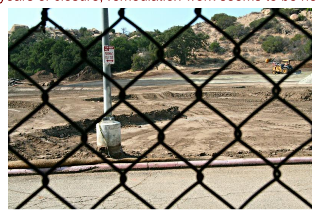
Page 6 - Winter 2017

After almost nine (9) years of closure, remediation work seems to be nearing completion.