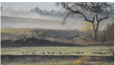
CNP: Canada Geese