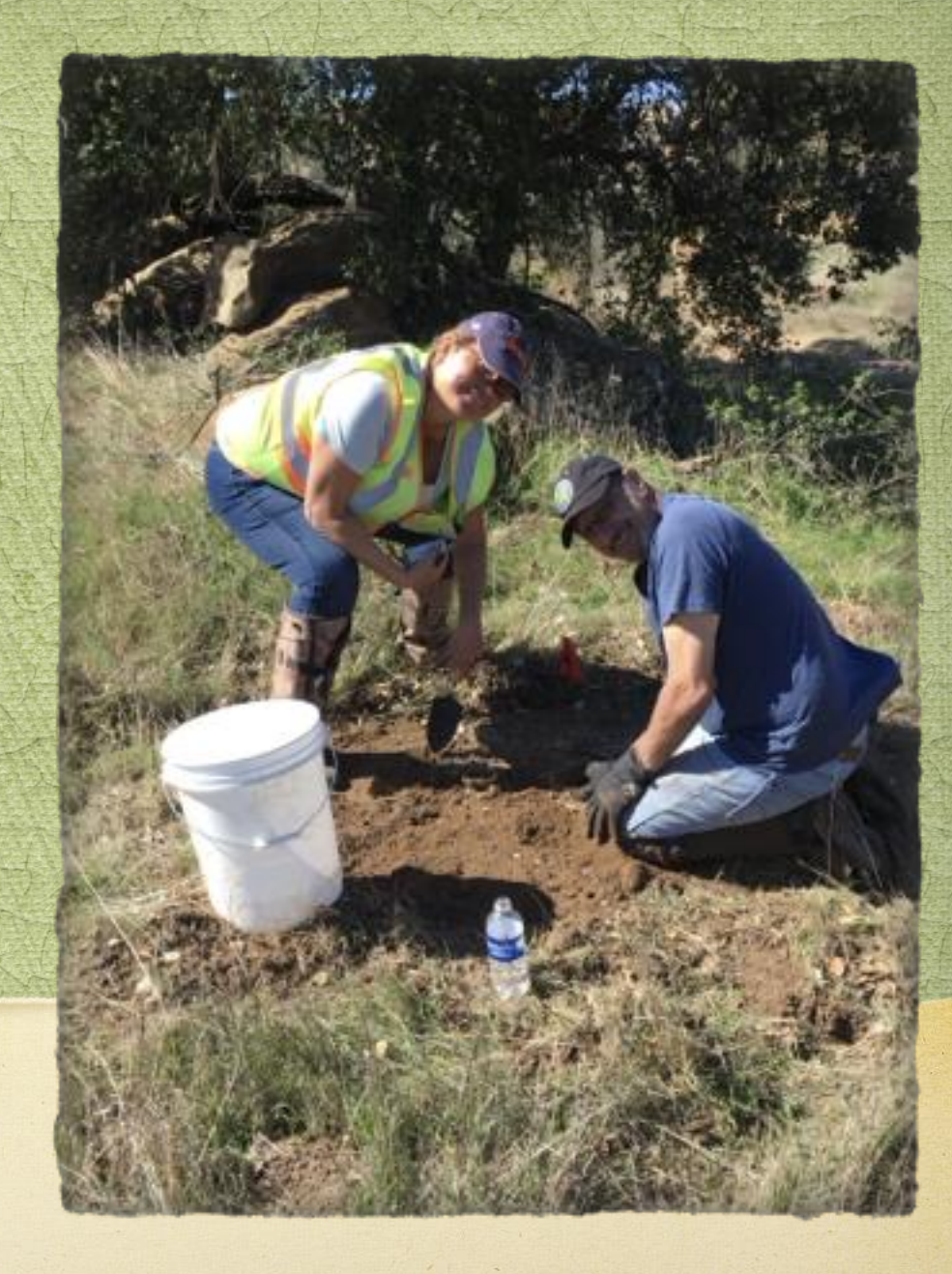
1st Planting day, 2/17/2018